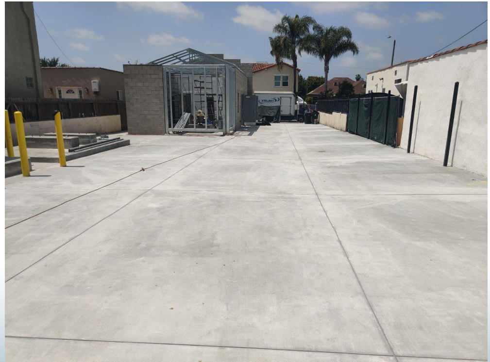
Framing, Painting, Pavement