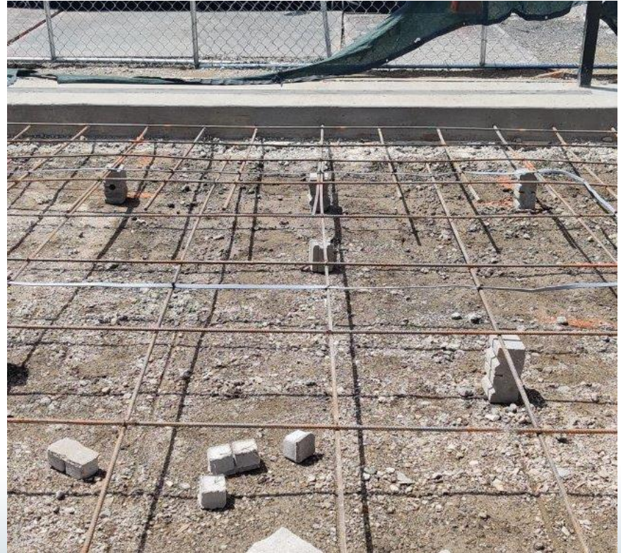
Pavement Prep Work