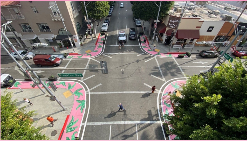
Camden-Brighton Demonstration Project Aerial Photo