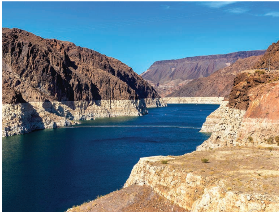
Low water level strip on cliff at Lake Mead, where a water shortage was also declared.

Most rain and snow falls in California from November through April. It then flows and melts to fill the reservoirs and aquifers with water we use for our homes, businesses and agriculture. It also supports fish and wildlife that depend on our rivers and wetlands.